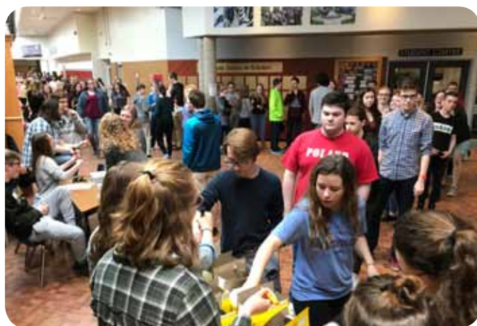
Baysiders enjoy a 'chill' treat to celebrate their "FoodFight2017" victory!

On behalf of BSS students, Student Council was happy to accept the challenge of Food Fight 2017. In April, local secondary schools competed to bring in the most non-perishable food items for the local food bank. Bayside spirit was strong as home forms were assigned a food type and encouraged to bring in at least one food item per student. By the end of the week, we had far surpassed our goal, with well over two thousand food items donated! BSS was crowned Food Fight champion for this year, in a contest where each school and their community are real winners.